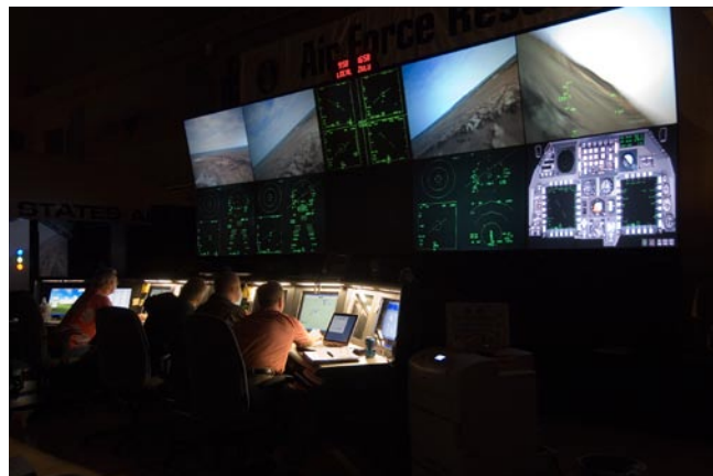
The DMO Testbed video wall shows the Viper 4-ship out-the-window views and cockpit displays

of the medium-fidelity Deployable Tactics Trainers (DTT) at AFRL Mesa flew in formation with the high-fidelity Multi-Task Trainers dubbed Vipers 1, 2, and 3. This opened the opportunity to employ one of the Vipers as a FAC-A platform, giving the pilot full 360 degree visual SA to execute precise skills required to conduct Close Air Support (CAS) missions, including TIC situations.