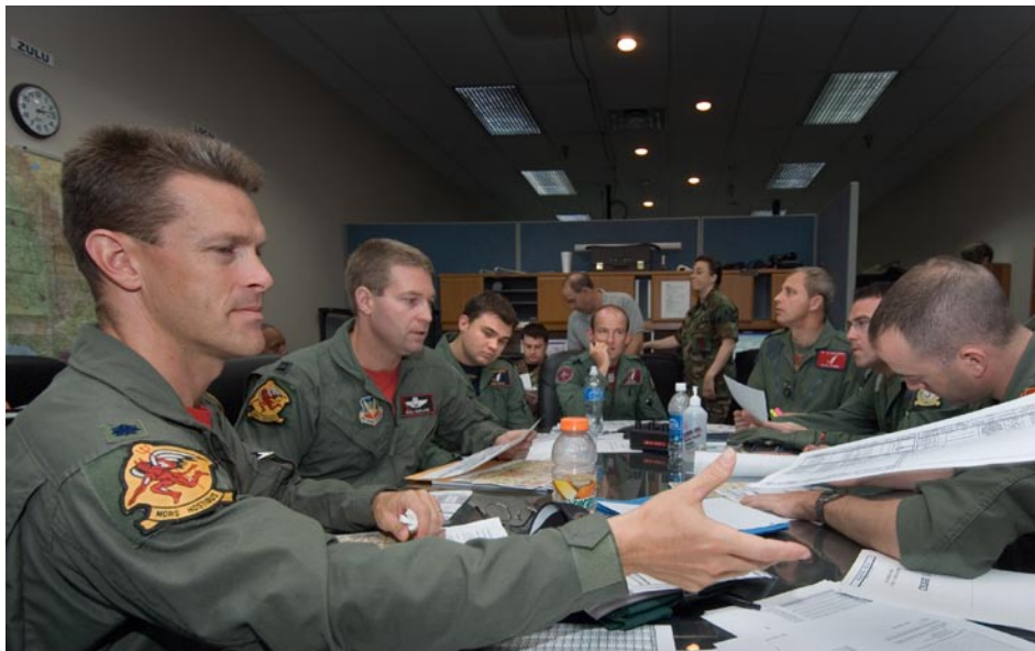
USAF and RAF warfighters finalize mission planning details prior to a Condor Capture mission

forced, in real-time, to create alternate communication plans as well as build their Situational Awareness (SA) through