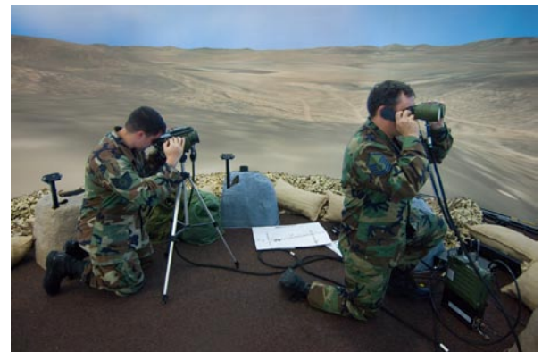
JTACs locate targets and call in air strikes in the immersive virtual environment of the prototype dome

Starting with Day 1 of the war, Condor Capture met with excellent individual and team composite force training research results. The mass debriefs highlighted mission success, as