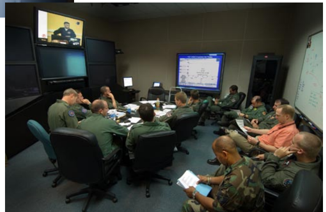
RAF mission commander in the UK briefs USAF and RAF warfighters at AFRL Mesa via VTC using shared mission data files

Condor Capture featured network technical innovations, as US and UK engineers were able to use the UK’s data logger, dubbed “NuNu,” to record all Distributed Interactive Simulation (DIS) packets. This allowed the UK node to have full playback control of all DIS data files representing the 300 to 400 air and ground entities in the exercise, and warfighters in the US and UK could debrief collectively from recordings of DIS traffic at the end of each day’s scenario. Crews in the US were able to collaborate, view, and speak to specific points throughout the briefs and debriefs. Additionally, engineers in the US synched debrief rooms 1 and 2 at AFRL Mesa, enabling researchers in the