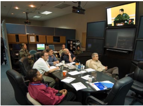
AFRL Mesa and DSTL experts conduct Condor Capture data collection from adjacent brief/debrief room

support from all MDS systems and warfighting functions. There was still some fog-of-war present with uncorrelated Red Air spikes and comm limitations; however, it provided realistic real-time training opportunities.