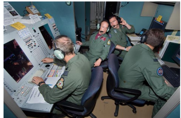
RAF warfighters manned AWACS Block 30/35 consoles and the Tactical Display Framework C2 interface at AFRL Mesa

After many Coalition Mission Training Research trials, the collaborative R&D program has transitioned to the operational Air Force. Recently, the USAF Deputy Chief of Staff for Operations, Plans, and Requirements endorsed the US and UK Air Forces arrangement to maintain long-term interoperability of the US DMO and the UK Distributed Simulation systems to provide a capability to conduct warfighter combat readiness preparation and training. AFRL Mesa will support development of the coalition network and participate in the first scheduled exercise in January 2008, tentatively called “Avenging Eagle.”