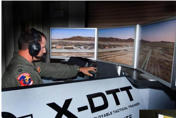
An F-16 pilot from Luke AFB prepares to fly FAC-A missions in a DTT simulator at AFRL Mesa

Other firsts included integration of deployable training systems into a large force coalition exercise. In this case, one