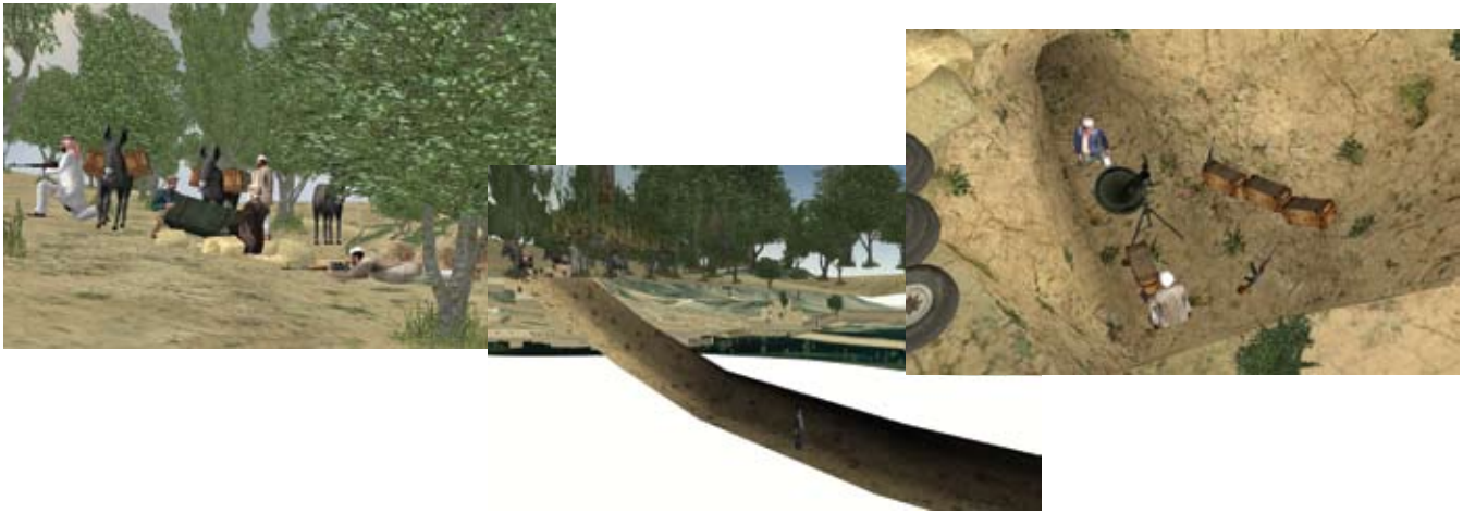
Three views in VRSG of a tunnel complex on MetaVR's Afghanistan virtual terrain: the entrance and exit and a cross-section view of the tunnel from below the terrain.

The tunnel and cave complex in this virtual terrain has an entry point in one of the buildings that is linked to a cave and tunnel position in the courtyard, which could be used as a mortar position. The tunnel exits some distance away in a heavily wooded area behind the building complex and courtyard. The tunnel network is modeled with geometry and textures much like the above-ground terrain. It can support the underground traversal of small entities such as small unmanned ground vehicles (SUGVs) or characters.