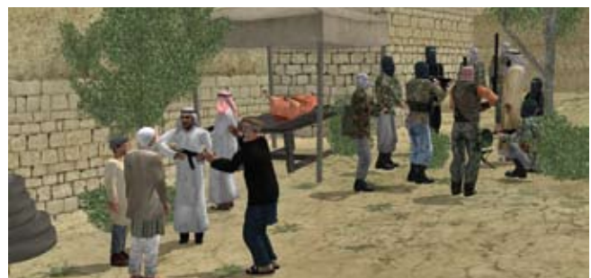
Images on the cover: Real-time scenes in VRSG of MetaVR's virtual Afghanistan terrain: an insurgent compound in the village, a close-up of a village elder character, a Talon UGV, and a US JTAC team.