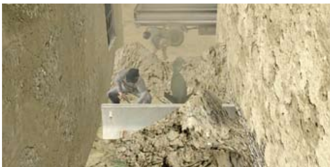
Insurgents burying a Mark 84 bomb fitted with a cell phone detonator. The dust created is visible to a patrolling UAV. The digging animation is one of many animations that are delivered with VRSG.

Using MetaVR Terrain Tools for ESRI ArcGIS, the 2 x 2 km terrain patch of the village was compiled in OpenFlight format. Terrain regions (such as fields, roads, and buildings) were cut out and marked by material type. Modeling artists imported this terrain patch into third-party modeling tools, built 3D content into the terrain, and modified the elevation to simulate higher resolution. The resulting modeled terrain patch was exported to a single model in MetaVR's model format. Using the Terrain Tools' feature-cutting capability, the surrounding area was generated in MetaVR's 3D terrain formats with the inset patch region cut out of the terrain. The modeled terrain patch is referenced by the terrain's cultural feature file and rendered by VRSG at run time as part of the terrain.