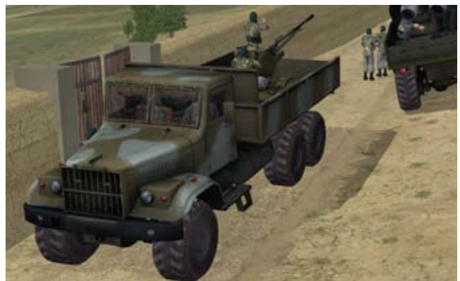
One of the technical vehicle models in MetaVR's 3D content library of military models, which is delivered with VRSG.

The modeled village is based on the small village of Khairabad in the southern part of the Kabul province. Khairabad, situated at an altitude of 1,843 meters, is located approximately 10-15 kilometers south of Kabul city center, next to Qalai Naeem in the Char Asiab district.