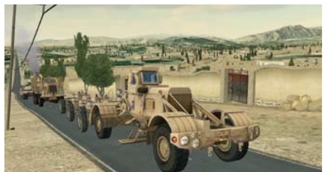
Simulated MRAP convoy (above) and groups of civilians and insurgents (below). The vehicles are among the full set of production MRAP vehicles in MetaVR's library of military models.

As a significant percentage of Afghanistan's population lives in mountainous terrain, training warfighters in a simulated environment that accurately represents mountainous regions with small population centers is critical. Unlike the simplified, flattened terrain used in urban environments in most image generators and video games, MetaVR's Afghan village is set among mountains and complex terrain features, enabling realistic training scenarios for mission planning and rehearsal of operations in mountain villages. The virtual terrain of this area was built from geospecific high-resolution elevation and imagery source data; it was augmented with finer level terrain details derived from the imagery to add to the realism near ground level.