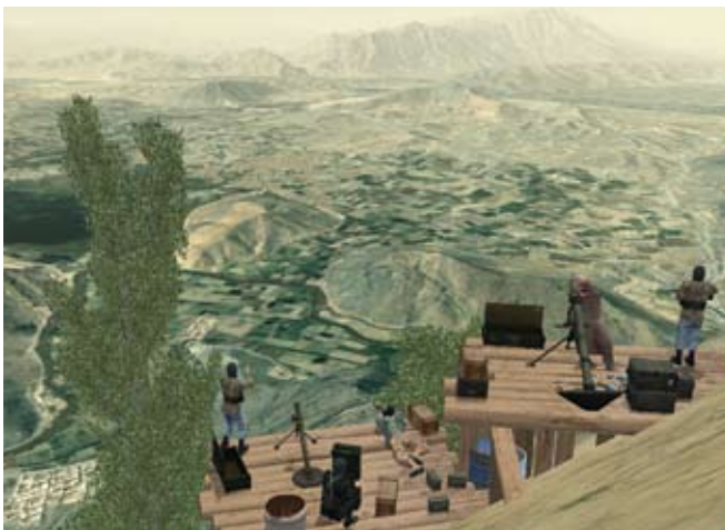
Insurgent stronghold in the mountains overlooking the built-up village area.

This Afghanistan virtual terrain provides the opportunity for users to conduct challenging exercises within its tunnel and cave network, as is demonstrated in the example insurgent stronghold. Accurately simulating typical below-ground entrances is another important part of preparing soldiers for Afghanistan and other mountainous regions.