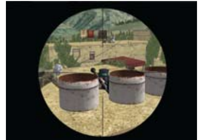
Real-time scenes in VRSG of MetaVR's virtual Afghanistan village: aerial view of the village, a JTAC team at an overwatch position, and a simulated scope view of two insurgent snipers in position on a rooftop.

To meet the needs of training NATO soldiers for coalition operations in Afghanistan, MetaVR™ has built 3D geospecific terrain covering 9,600 square km, featuring a high-resolution virtual village with over 500 buildings in the Afghan province of Kabul. This virtual terrain is available in both MetaVR's round-earth and flat-earth formats for visualizing in the company's Virtual Reality Scene Generator™ (VRSG™). The terrain is also delivered with correlated SAF databases in CTDB and OTF formats.