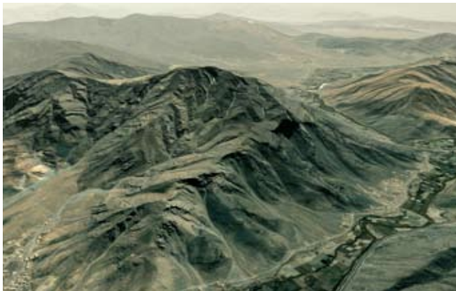
Afghanistan terrain tiles from MetaVR's virtual terrain of Asia.

These terrain tiles are suitable for real-time visualization, and simulation applications, including synthetic vision, glass-cockpit displays, intelligence surveillance, reconnaissance applications, and fixed-wing cockpit simulation.