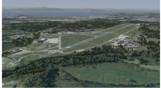
MetaVR's virtual terrain of the Vermont Air National Guard base and airfield at Burlington International Airport, Burlington, Vermont, with Lake Champlain visible in the background.

The Metadesic North America dataset contains high-resolution insets (some include cultural features) of 59 US cities such as Anchorage, San Francisco, St. Louis, Orlando, and Washington DC. The insets also include several military installations.