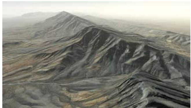
MetaVR's virtual terrain of the area around the White Sands Missile Range in New Mexico.

Specifications for MetaVR's North America terrain dataset: Database size: 1,077 geocells (10,772,200 sq km) Size on disk: 1,684 GB Terrain post spacing: 60 mpp Source imagery: approximately 4.5 TB Elevation coverage: 3 arcseconds (70-100 meter) Imagery coverage: 15 mpp LandSat7 fused color (L7), with high-resolution insets of approximately 59 areas of interest with .5, 1, 5, and 15 meter imagery for several US cities and most US military installations