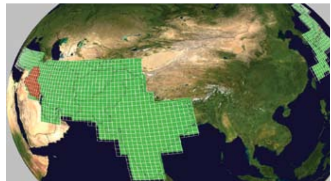
Tile coverage map generated by MetaVR Model Viewer.

The following symbolic representation shows the geographic coverage of this 3D dataset's terrain tiles.